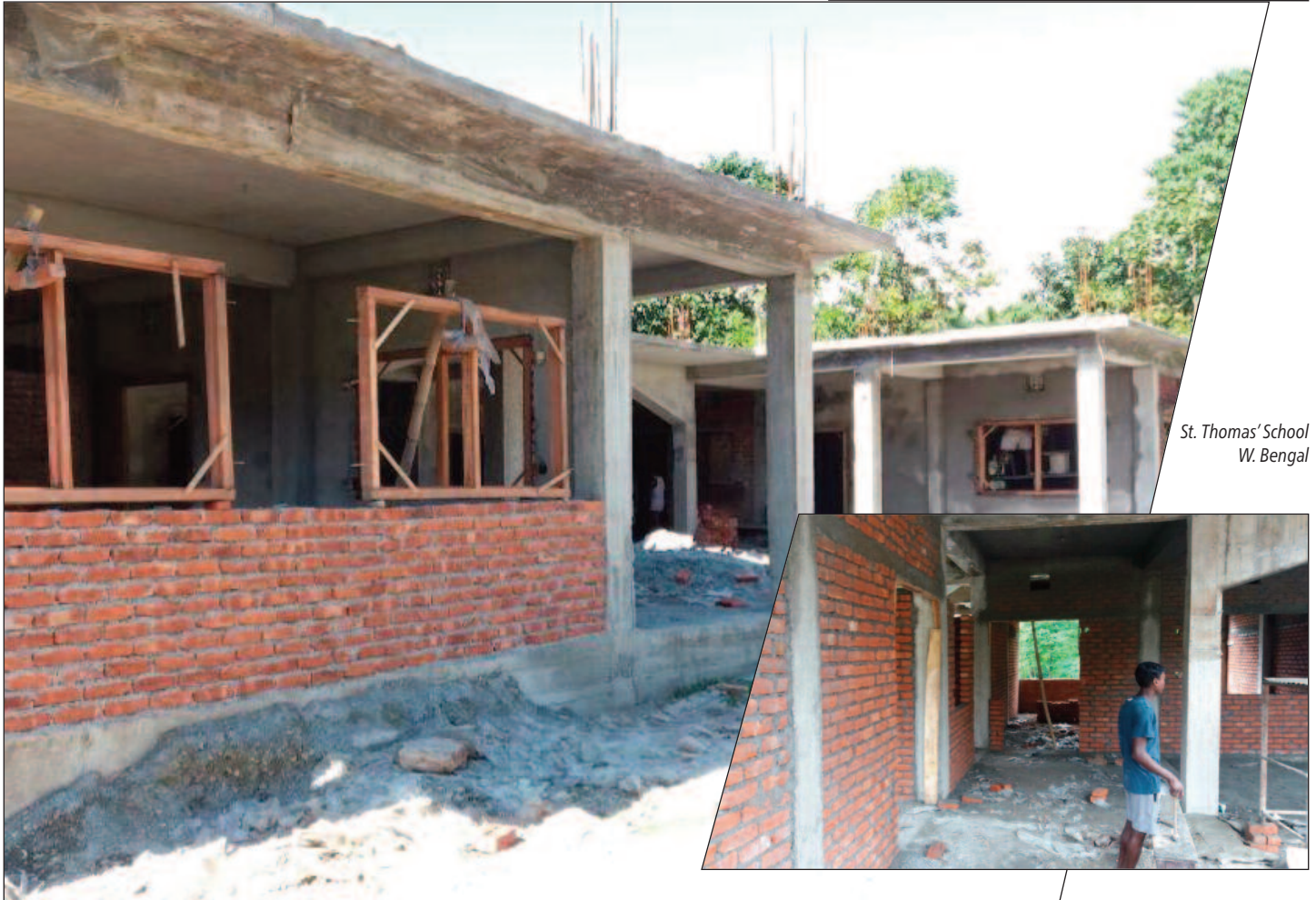
St. Thomas' School W. Bengal