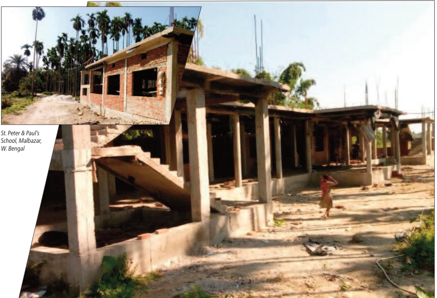
St. Peter & Paul's School, Malbazar, W. Bengal