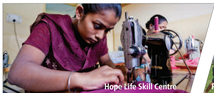
Hope Life Skill Centre

This appears to be run fine, now with 181 pupils getting vocational training each year. It is run by Hope Foundation.