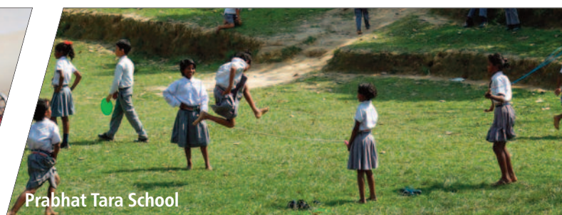
Prabhat Tara School