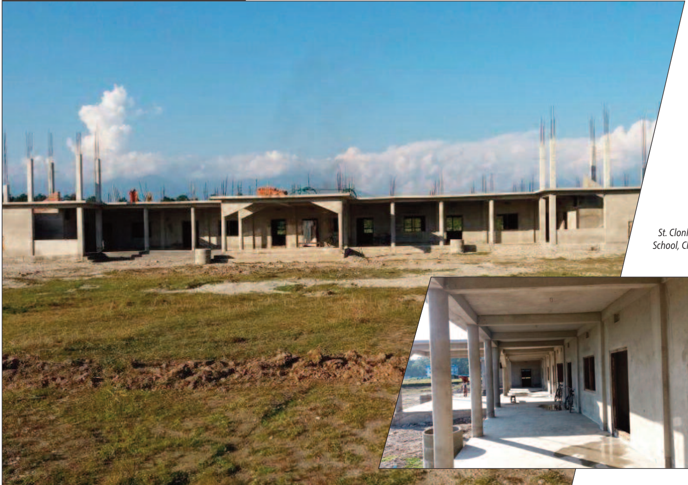
St. Clonleth's School, Chalsa